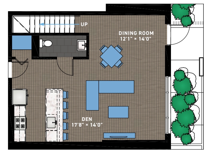
1ST FLOOR 723 SF